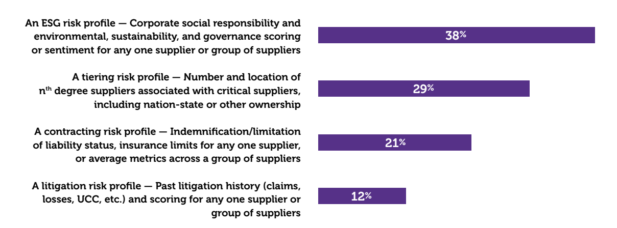
Figure 3: Risk Category Providing Additional Benefit

Note: Internal Audit Foundation/Grant Thornton Supply Chain Survey. Question: What risk category, if added or elevated to the same level as the other categories, would add the most additional benefit to your supply chain risk management program? n = 34